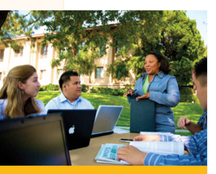
UCR attracts diverse, high-achieving students – many of them first generation college-goers – and provides a quality education that allows them to achieve their dreams.

experiences, students will be afforded ample opportunities to conduct hands-on research or engage in a creative endeavor that will add depth of understanding to their classroom learning. Again, achievement of this goal requires having sufficient faculty to provide such opportunities.