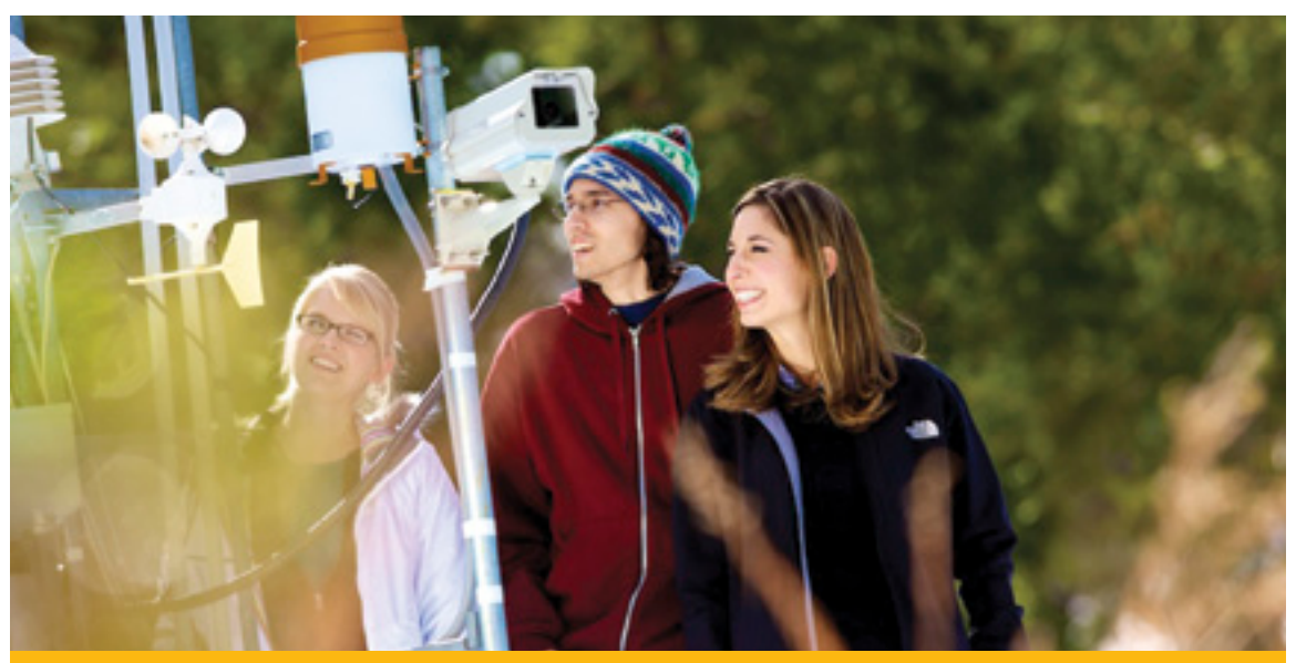
Philanthropists are drawn by programs that guide their passions and inspire their imaginations, such as the student use of embedded cameras to observe biodiversity at one of UCR's seven natural reserves.

value of a research university. The advancement operation will achieve a high level of integration and trust, both within the advancement staff and with campus partners. A sharp focus will be placed on the interests, passions, and goals of external stakeholders, while adhering to the highest standards of integrity, ethics, and collaboration.