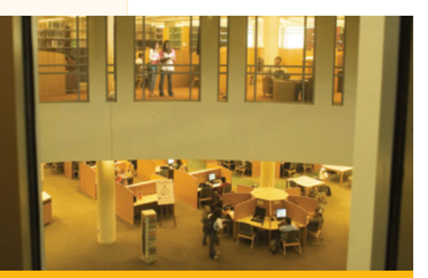
As they embrace the powerful tools and technologies of the future, UCR's libraries will be an even more essential partner in research, teaching, and the quest for knowledge.

Community Support – UC Riverside has earned tremendous support throughout the Inland Southern California region. Our elected officials at the local, state, and federal levels recognize the value of the university and promote the interests of UCR's students, programs, and research. Community and business leaders are strong and loyal advocates for UCR, fully embracing new initiatives and planned