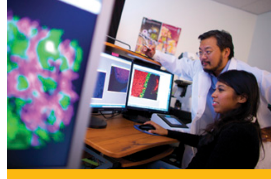
UCR has earned a reputation for incubating groundbreaking ideas and translating them into actionable solutions. UCR geneticists, biologists, psychologists, anthropologists, entomologists, and engineers are developing new approaches for improving health care in the 21st century.

Another aspect of the research infrastructure